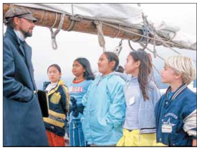
Isla Vista students take orders from their Captain.