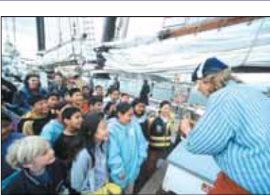
Local students set off on their adventure aboard a tall ship.

Imagine what it would be like, stepping aboard one of these historic vessels, to live the life of a 19th century sailor. This April, local 4th grade students from the Santa Barbara area will have that chance when the replica tall ship Spirit of Dana Point comes to Santa Barbara. She will be here for two weeks in April, and again in May, to host overnight living history programs with the Santa Barbara Maritime Museum.